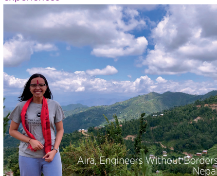
Aira, Engineers Without Borders Nepal

employability.uq.edu.au/short-term-experiences